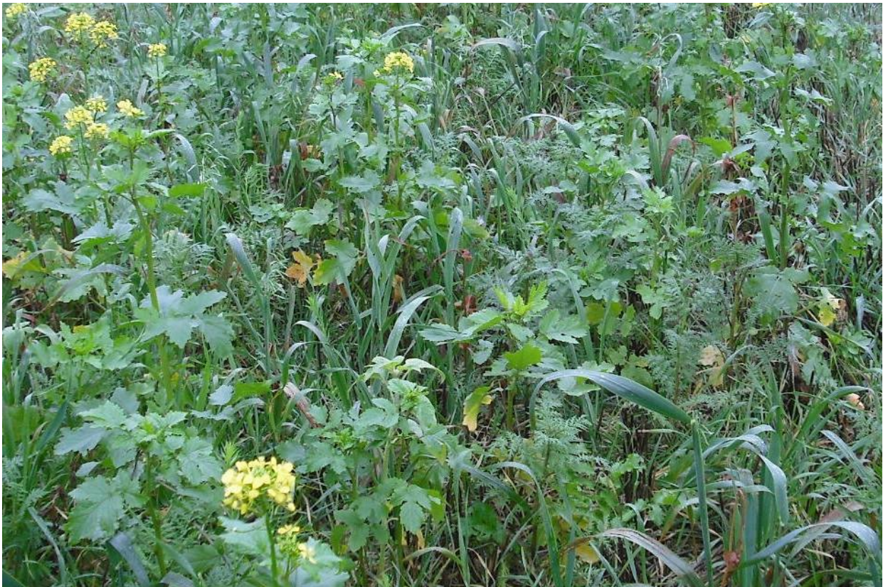
Multi-species winter cover to improve soil health

These actions can help with the long-term productivity and resilience of the soil to benefit food production. They can also provide environmental benefits, such as better water quality, improved climate resilience and increased biodiversity.