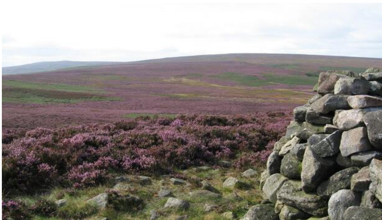
Assess moorland habitat